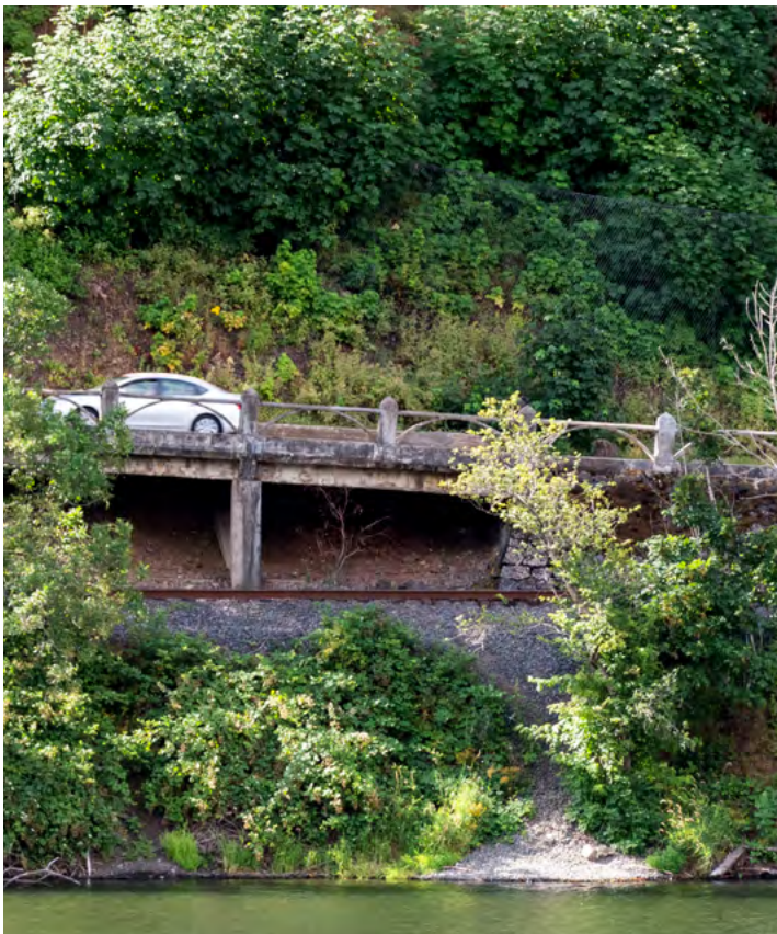
Current photo of the west viaduct near rail line.