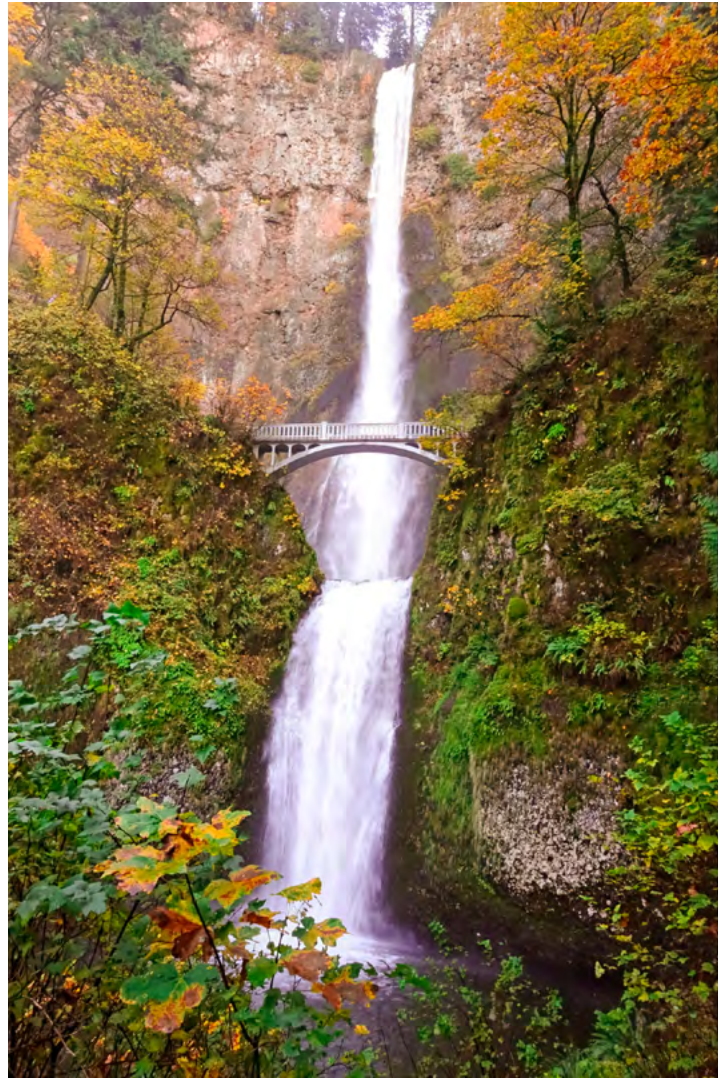
Looking up at Multnomah Falls and Benson Bridge.

Starting in fall 2024, we are restoring the over 100-year old viaducts. The east and west viaducts will be closed, one at a time, while work is underway.