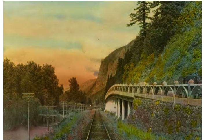
Historical image of the west viaduct next to rail line.