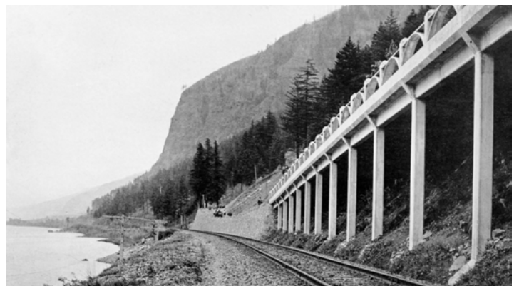
Historical image of the west viaduct next to rail line.